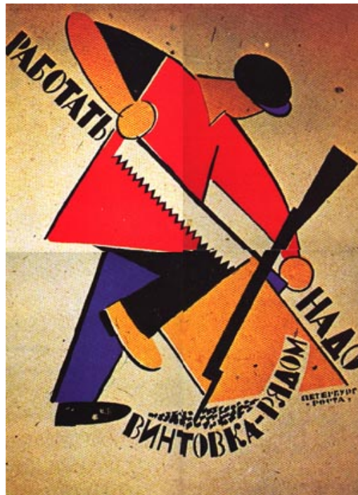
Armed Worker (Soviet Poster)